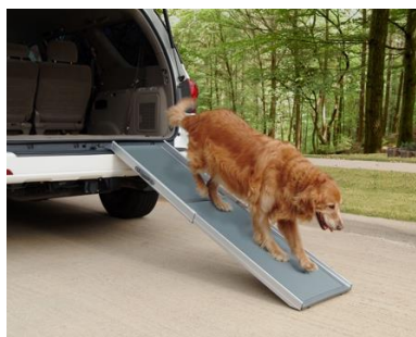
Deluxe Telescoping Pet Ramp