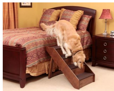
Extra Large Wood PupSTEP Stairs